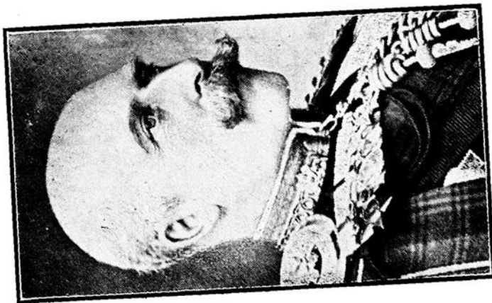
T. R. H. THE DUKE AND DUCHESS OF CONNAUGHT.