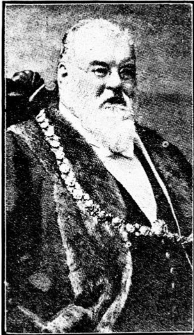
RT. HON. SIR FRANK WILLIS, LORD MAYOR OF BRISTOL.