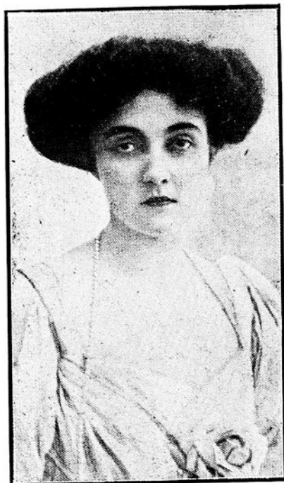
H. R. H. PRINCESS PATRICIA.