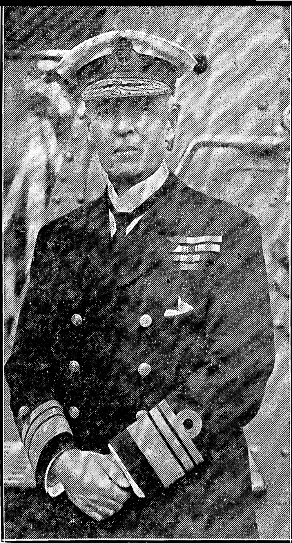
VICE-ADMIRAL SIR FREDERICK FIELD, Commander of the British Special Service Squadron, which is coming to Halifax.