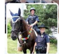
HRP Mounted Patrol @HRPMountedUnit FOLLOWS YOU

Two of our most popular units, the K9 and Mounted Units, joined the Twittersphere this summer. Follow them at @HRPMountedUnit and @HRPK9Unit.