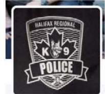
HRP K9-Unit @HRPK9Unit FOLLOWS YOU