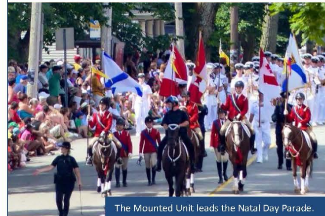
The Mounted Unit leads the Natal Day Parade.