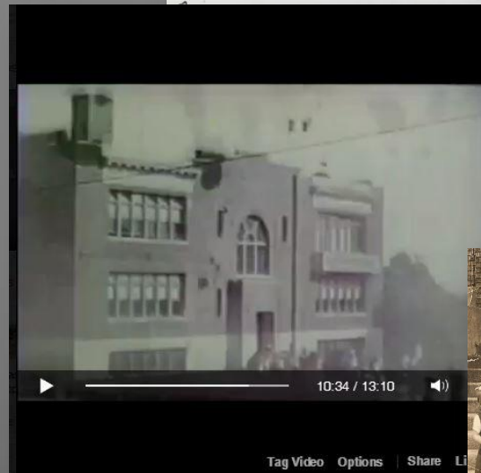
NS Archives News reel of St. Joseph's A. McKay