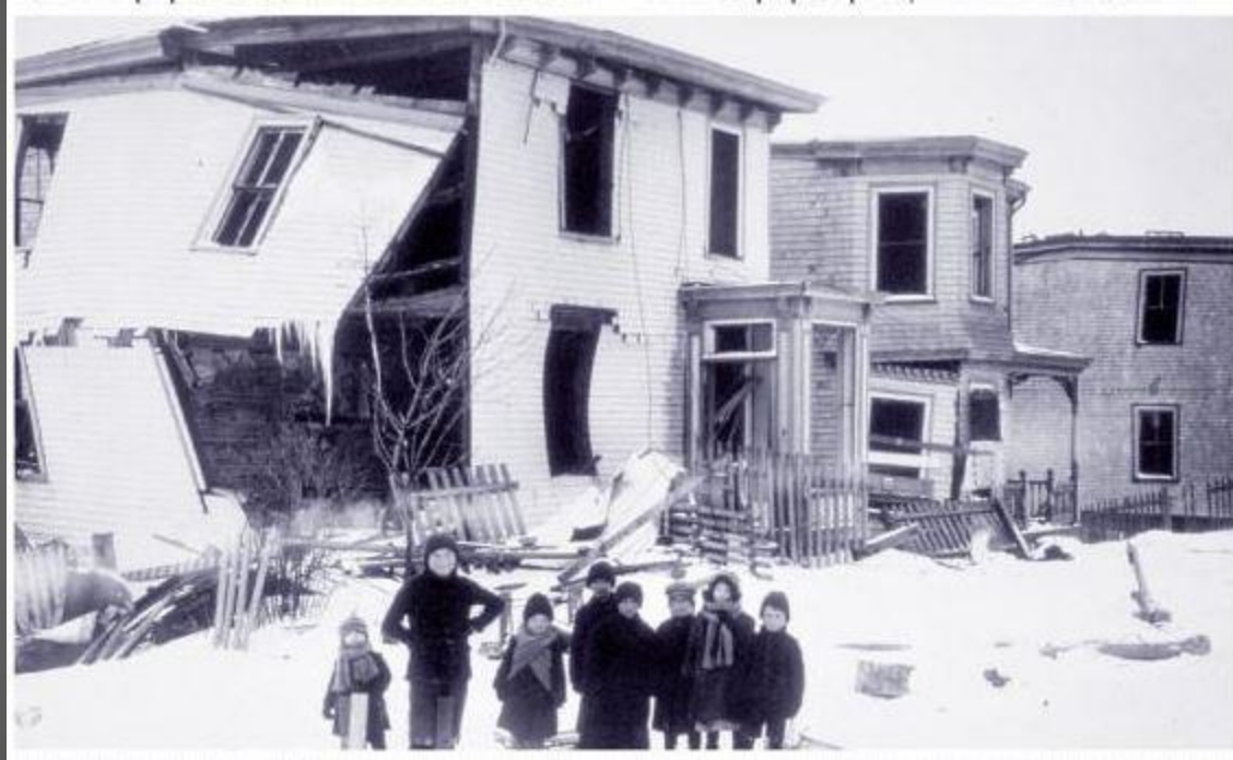
Children stand in front of destroyed North End houses