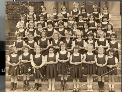
Class of 1958