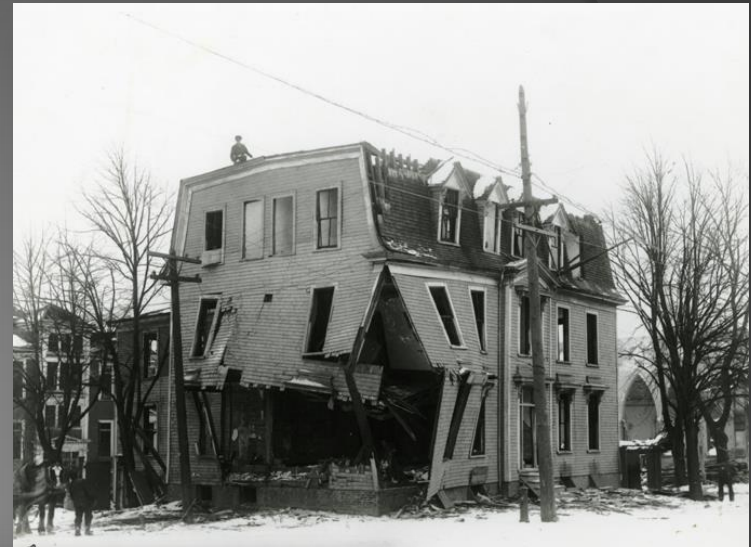
St. Joseph's orphanage and school (behind) on Gottingen at Kaye