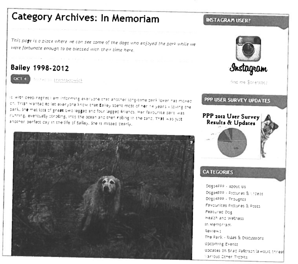
This is how the "In Memoriam" section appears on the blog.

It has become a place for owners and friends to share condolences and in a way a permanent place to honour the memory of a long time park companion.