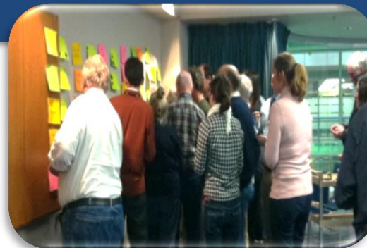
Stakeholders participating in Workshop II

~US Environmental Protection Agency 2010