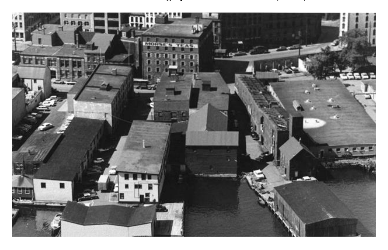
Attachment D: Photograph of 1877 Hollis Street (c.1960)