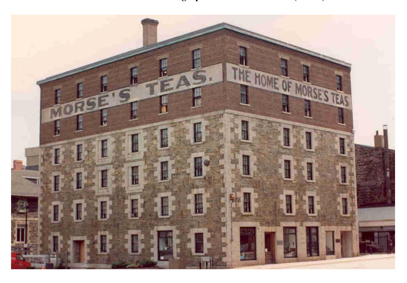
Attachment B: Photograph of 1877 Hollis Street (c.1980)