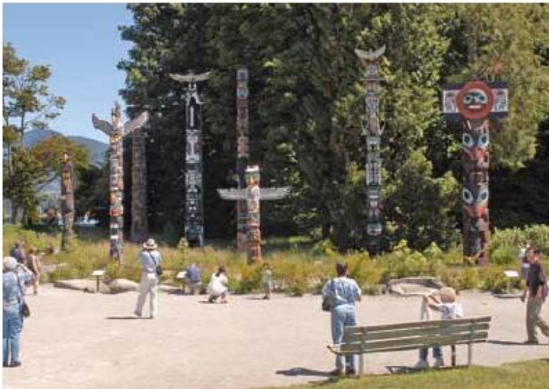
Over the years, several landscape architects and architects have made specific contributions to the evolving functions of Vancouver's Stanley Park. These include the play areas, totem groupings and aquarium that are now integral to the park's heritage value.