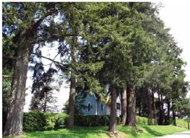
The rhythmic pattern created by the regular spacing of trees along the street is a character-defining element of the Avenue of Trees in Surrey, BC that can be used as evidence to restore the row if a gap develops.

A preservation or rehabilitation project may also include elements of restoration, such as work on an ornamental fountain in the centre of a formal garden. Any restoration interventions must be based on clear physical, documentary or oral evidence and detailed knowledge of the earlier forms and materials.