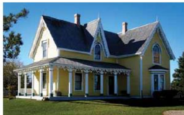
Based on documentary evidence, including an 1880 engraving, the original fenestration of the Biddeford Parsonage Museum in P.E.I. was restored and roof finials replaced.