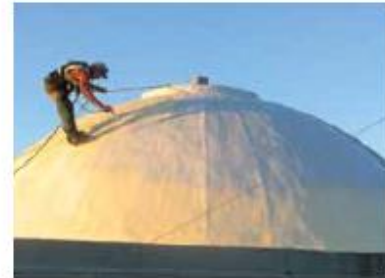
The dome of Melville City Hall was originally an uninsulated, painted-metal covering that caused persistent condensation problems. Applying insulating polyurethane foam with aluminized coating was a cost-effective solution that was compatible with the historic metallic look of the dome. If a more elaborate solution is contemplated in the future, the polyurethane could be removed.

Interventions to accommodate rapidly evolving technologies or short-lived objectives must be designed with particular attention to reversibility. If the new element is equipment that requires regular replacement, it is important to anticipate a large enough access for future upgrades.