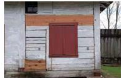
A condition assessment of the exterior walls and frame of this Storehouse at Fort Langley, BC found extensive deterioration of some timbers, which required replacement in kind. The dimensions, hewn finish and species of wood used in the repairs matched those replaced. The photograph shows part of one storehouse wall after the repairs were completed, but before the new timbers were whitewashed.