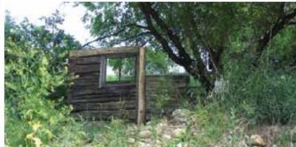
The character-defining elements of Doukhobor Dugout House NHSC in Saskatchewan, such as the window frames, had suffered visible deterioration from exposure to the elements. A long-term repair solution was necessary to prevent further decay and to preserve the site's heritage value.

Following the reinforcement treatment of treating the logs with preservatives, collapsed character-defining elements were reassembled based on records from previous interventions and existing traces on the site.