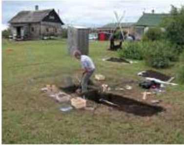
Ground-penetrating radar was used at McPherson House in Fort Simpson, NT; this guided archaeological excavations limiting the impact on the site.

(a) Evaluate the existing condition of character-defining elements to determine the appropriate intervention needed. (b) Use the gentlest means possible for any intervention. Respect heritage value when undertaking an intervention.