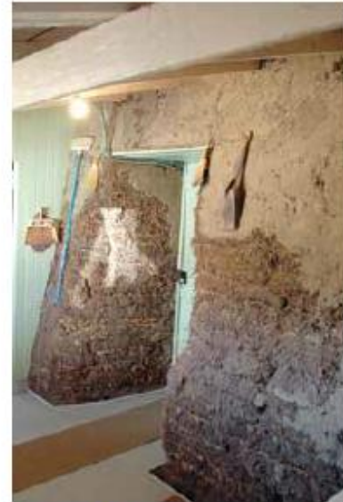
The lean-to is a character-defining element that shows the evolution of the Addison Sod House in Saskatchewan from a rustic sod dwelling to a comfortable home. Removing the later changes to restore the house to an earlier period would not be appropriate because it would remove elements that have heritage value.

A fine old storefront that has been modernized may have lost its heritage value. However, some changes may have acquired value, such as an art-deco stainless steel over-cladding or a marquee added to a popular urban theatre. Not every change to an historic place has heritage value, but those that do should be identified in a Statement of Significance. For historic places that were formally recognized some time ago, the process of determining if there is heritage value associated with later changes is an important step in the conservation process.