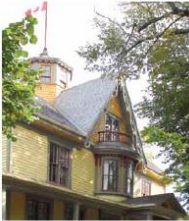
When the windows of Lefurgey House in Summerside, PEI were damaged in a fire, instead of replacing the entire windows, only the broken glass was replaced. The replacement glass, salvaged from a nearby house that was replacing its windows, had similar properties and wavy appearance.

Conserve heritage value by adopting an approach calling for minimal intervention .