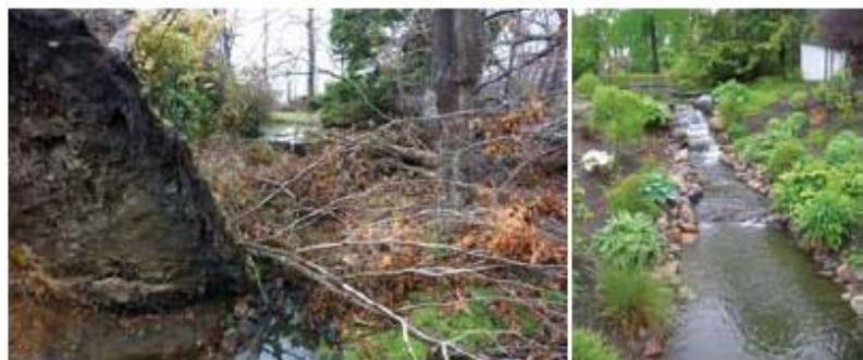
The extensive damage caused by Hurricane Juan to the Halifax Public Gardens required substantial replanting. The large scope of work is still considered a minimal intervention because any less work would have negatively affected the heritage value of the place.

Minimal intervention has different meanings for Preservation , Rehabilitation and Restoration . In the context of Preservation , it means undertaking sufficient maintenance or repairs to ensure the longevity of the place while protecting heritage value. In the context of Rehabilitation , it might mean limiting the proposed new use, addition or changes. In a Restoration , minimal intervention is a delicate balance between removals and recreations to represent the historic place's condition at a specific time in its history.