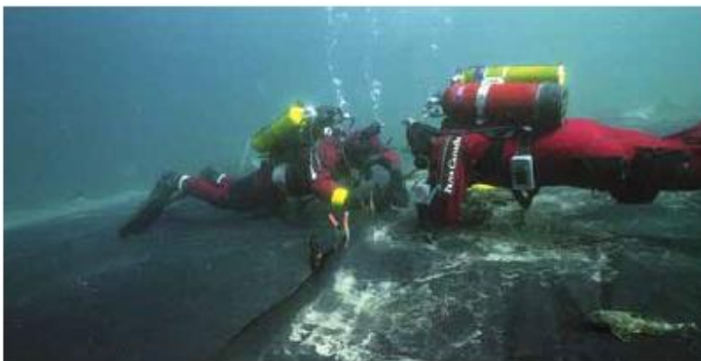
Wrecks at Red Bay NHSC, NL, such as this Basque Period wreck, are reburied using sand and tarp to ensure their long-term preservation. Their condition is periodically assessed through monitoring.