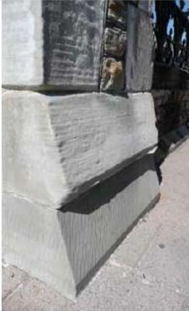
The new pieces of stone on the Wellington Wall at the Parliament Grounds in Ottawa are clearly visible on close inspection due to a different tooling technique.

(a) Make any intervention needed to preserve character-defining elements physically and visually compatible with the historic place and identifiable on close inspection. (b) Document any intervention for future reference.