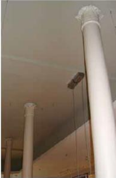
These cast iron columns were uncovered and restored when CentreBeam Place, in St. John, was rehabilitated.

(a) Repair rather than replace character-defining elements from the restoration period. (b) Where character-defining elements are too severely deteriorated to repair and where sufficient physical evidence exists, replace them with new elements that match the forms, materials and detailing of sound versions of the same elements.