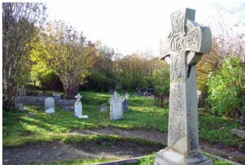
A condition assessment and evaluation undertaken before an intervention at Belvedere Cemetery in St John's Ecclesiastical District, would reveal that the well-aged and weathered patina found on the grave markers is not damaging. It is in fact a character-defining element of this historic place and should be preserved.

Investigations themselves are forms of intervention and as such should follow a minimal intervention approach. Investigations should begin with observation and non-invasive probes followed by careful sampling and physical openings or selective disassembly if required. The objective is to obtain enough evidence without unnecessarily disturbing the historic place.