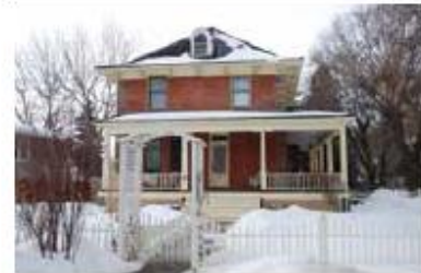
The original plans for the Margaret Marin Residence in Edmonton indicate a decorative upper balcony that was never built. During recent renovations, it was decided not to construct this balcony because it would have conveyed a false sense of historical development.