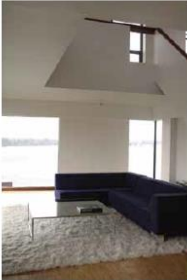
The character-defining interior features and finishes, such as the birch floors, window frames and views of the city at Habitat 67 in Montreal, have been carefully maintained, repaired and retained.

(a) Conserve the heritage value of an historic place . (b) Do not remove, replace or substantially alter its intact or repairable character-defining elements . (c) Do not move a part of an historic place if its current location is a character-defining element.