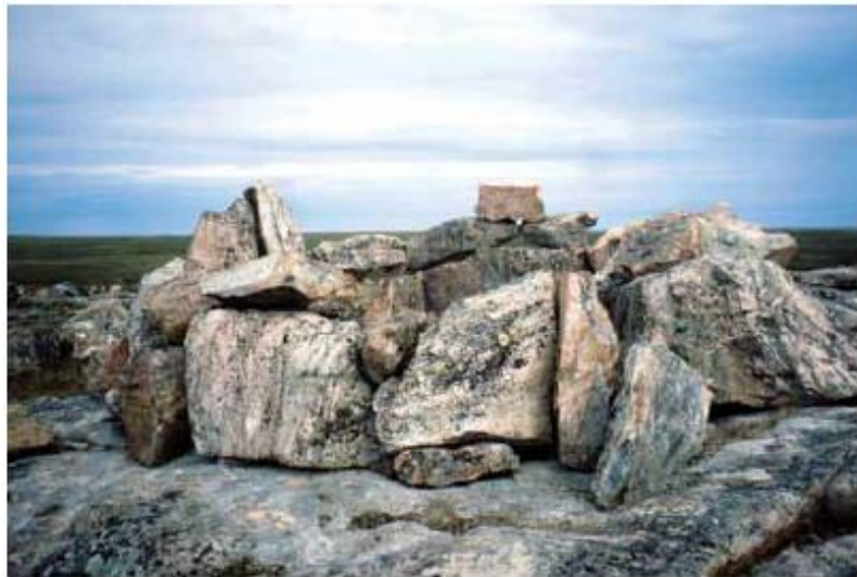
Centuries ago, the inland Inuit, or Kivallirmiut, recognized the hunting potential of the annual fall crossing of massive herds of caribou and began establishing seasonal camps along the Kazan River. Today Fall Caribou Crossing NHSC in Nunavut, is noted not only for its archaeological remains and former importance to the Kivallirmiut, but also for its natural landscape, continued use as a hunting area and the vitality of the oral history and traditions of the people who know it best. Moving any of these stones would impair heritage value.

Part (c) addresses the wholeness of a place and reinforces that spatial relationships can be character-defining. In a garden, for example, moving a central feature to another location affects the heritage value of the entire landscape. In an archaeological site, location may be critical to understanding other elements that are now missing. In an engineering work, machinery moved from its original position can lose part of its meaning, thus diminishing its heritage value.