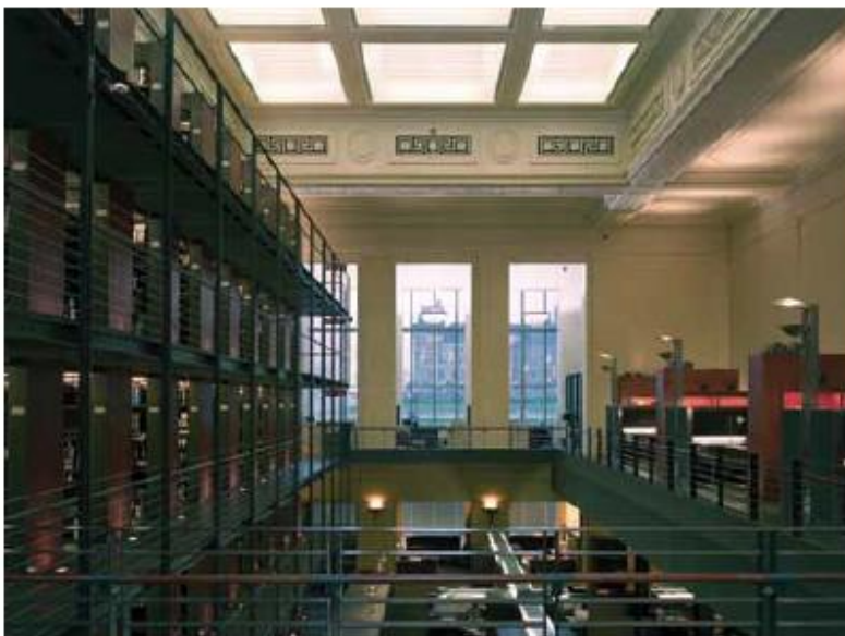
Space to temporarily house the Library of Parliament in the former Bank of Nova Scotia Building on Sparks Street in Ottawa. The entire intervention was designed to be reversible.