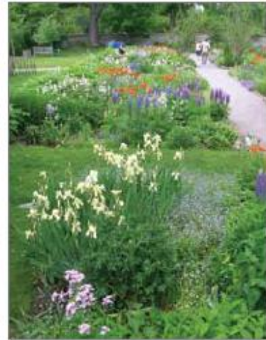
In areas of Maplelawn and Gardens NHSC in Ottawa where insufficient historical evidence existed, a Rehabilitation approach was taken. New perennial beds were designed using adjacent layouts and historical information from other parts of the garden as inspiration. This approach resulted in compatible new beds that completed the garden and strengthened its overall heritage value.

Addressing significant deterioration is an implicit goal of this standard. If deterioration is not properly addressed, it can result in a loss of heritage value.