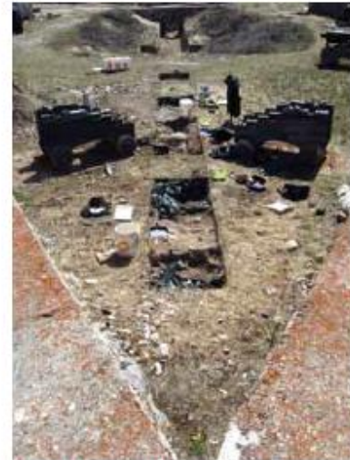
Nearby archaeological resources were protected when stabilizing the Prince of Wales Fort in Manitoba. Strategically placed archaeological investigations on the surface of the ramparts established the extent of artifacts, including their depth below the surface.

Part b) acknowledges a responsibility to protect archaeological resources, but also reinforces the message that they must be protected and preserved in situ . This is a highly regulated aspect of conservation: one must identify and engage the authority having jurisdiction. The information required to best preserve and protect the site is gained from a variety of archaeological interventions. A strategy to recover the information using the most appropriate and effective methods needs to be developed in an effort to strike a balance between gaining knowledge from investigations and preserving the resources in situ .