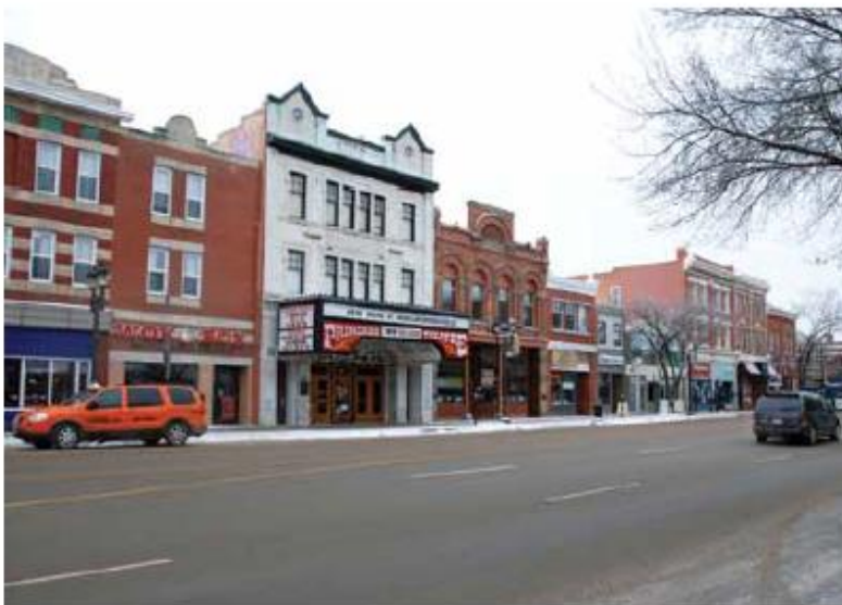
The Old Strathcona Provincial Historic Area in Edmonton is a diverse historic district. The individuality of each building and evidence of the era of its construction has been maintained. Earlier simply constructed wood buildings stand alongside later more sophisticated masonry buildings and modern infill structures.

The materials removed from historic places are often salvaged and reused. Careful consideration must be given to how and where this is done. For example, using a salvaged lamppost from an historic landscape with identifiable characteristics at another site does not conform to the standard. On the other hand, using recycled bricks of the same age and appearance, or reusing identical windows within a building are appropriate from both conservation and sustainability standpoints. Where it is deemed critical to the honesty of the work, such additions can be rendered distinguishable in a discreet way.