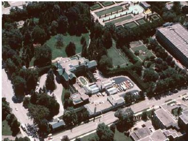
The grand residential estate at Parkwood in Oshawa is a cultural landscape that covers 4.8 hectares. Aerial photography was used to document the large-scale site during the conservation process.

While the main reason for making interventions identifiable is honesty, it is also a means of keeping a record of the place. The historic place itself is its own best document.