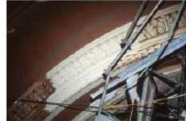
When restoring decorative plaster in the Walker Theatre in Winnipeg, moulds were made of existing plaster elements. The deteriorated plaster was then patched and repaired using the moulds to match the original.

Replacement in kind may sometimes be difficult, and substitute materials may be necessary when the original materials are damaging to character-defining elements or hazardous to public health. Some mid-20 th century materials are no longer made or cannot be manufactured in small batches. In a place where the heritage value depends on a material that is no longer available, the ongoing loss of the material will eventually lead to a difficult choice: accepting breakage or replacing the entire material or assembly with one that is physically and visually compatible with the original.