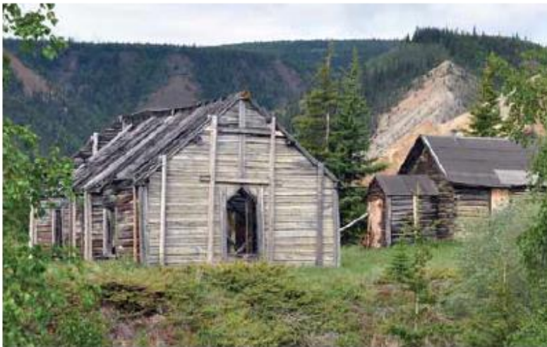
These buildings, along with others at St. Luke's Anglican Rectory and Church in the Yukon, were temporarily stabilized using a variety of measures including adding sandwich bracing, cable bracing, heavy frames, roll roofing, and covering door and window openings in order to keep out snow and rain. Stabilization allows the structures to be adequately researched and their eventual restoration to be planned.