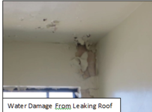
Water Damage From Leaking Roof