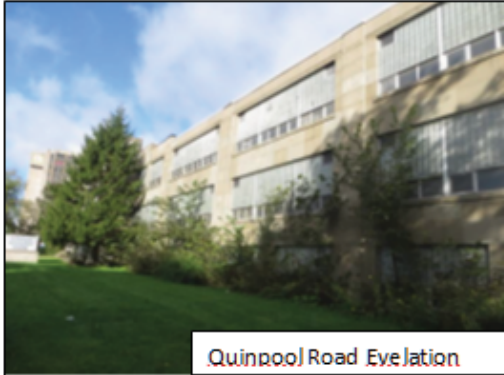
Quinpool Road Elevation