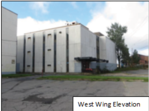
West Wing Elevation