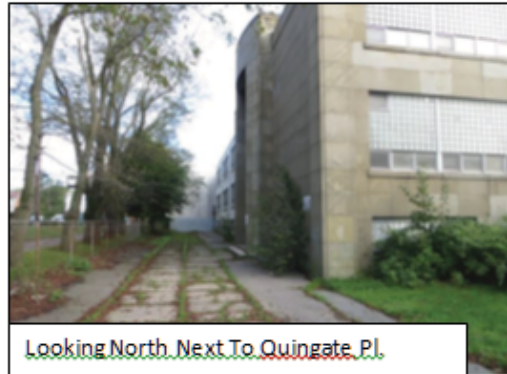
Looking North Next To Quingate Pl.