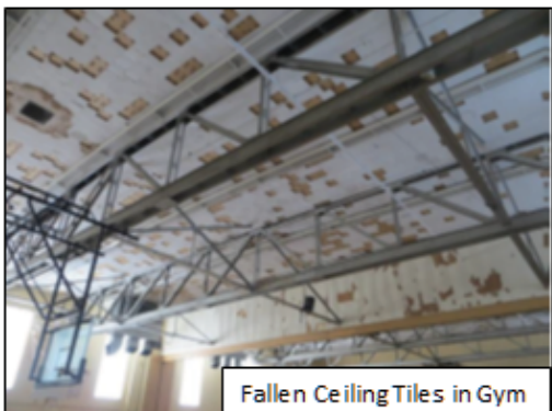
Fallen Ceiling Tiles in Gym