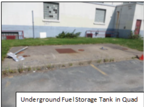
Underground Fuel Storage Tank in Quad