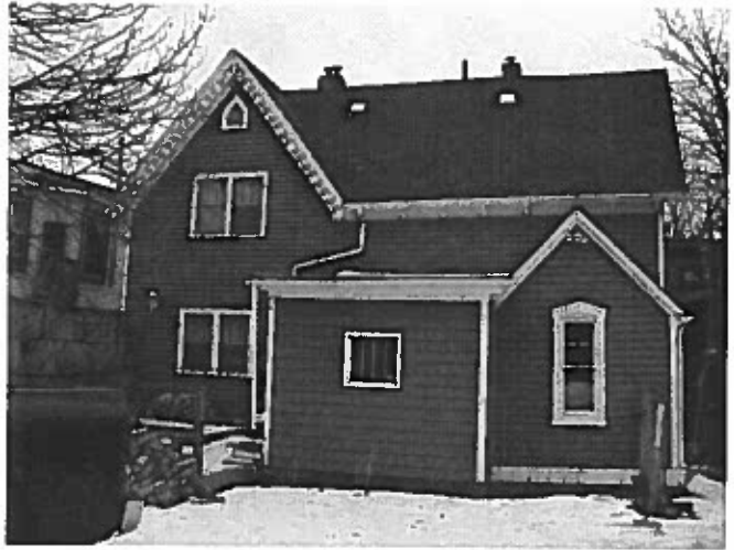
Figure 2: Rear of the Henry Elliot House (2007) with two additions that were removed to obtain the required area for subdivision, these were not character defining elements.