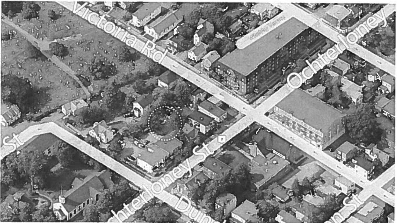
Figure 3: There are no character defining elements within the new subdivision at the rear of the historic building as it consists of an open space with gravel cover (circled above), previously used for parking (Bing Maps).