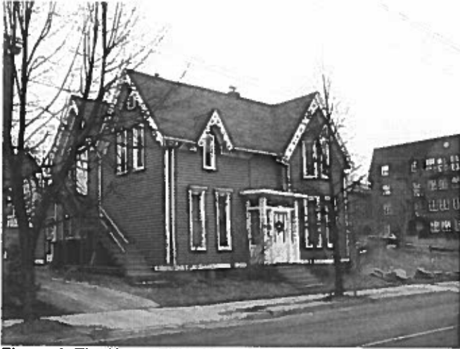
Figure 1: The Henry Elliot House (2013) will be preserved in its entirety as part of a development agreement that allows for the construction of a seven storey building to the north and at the rear of the heritage property.