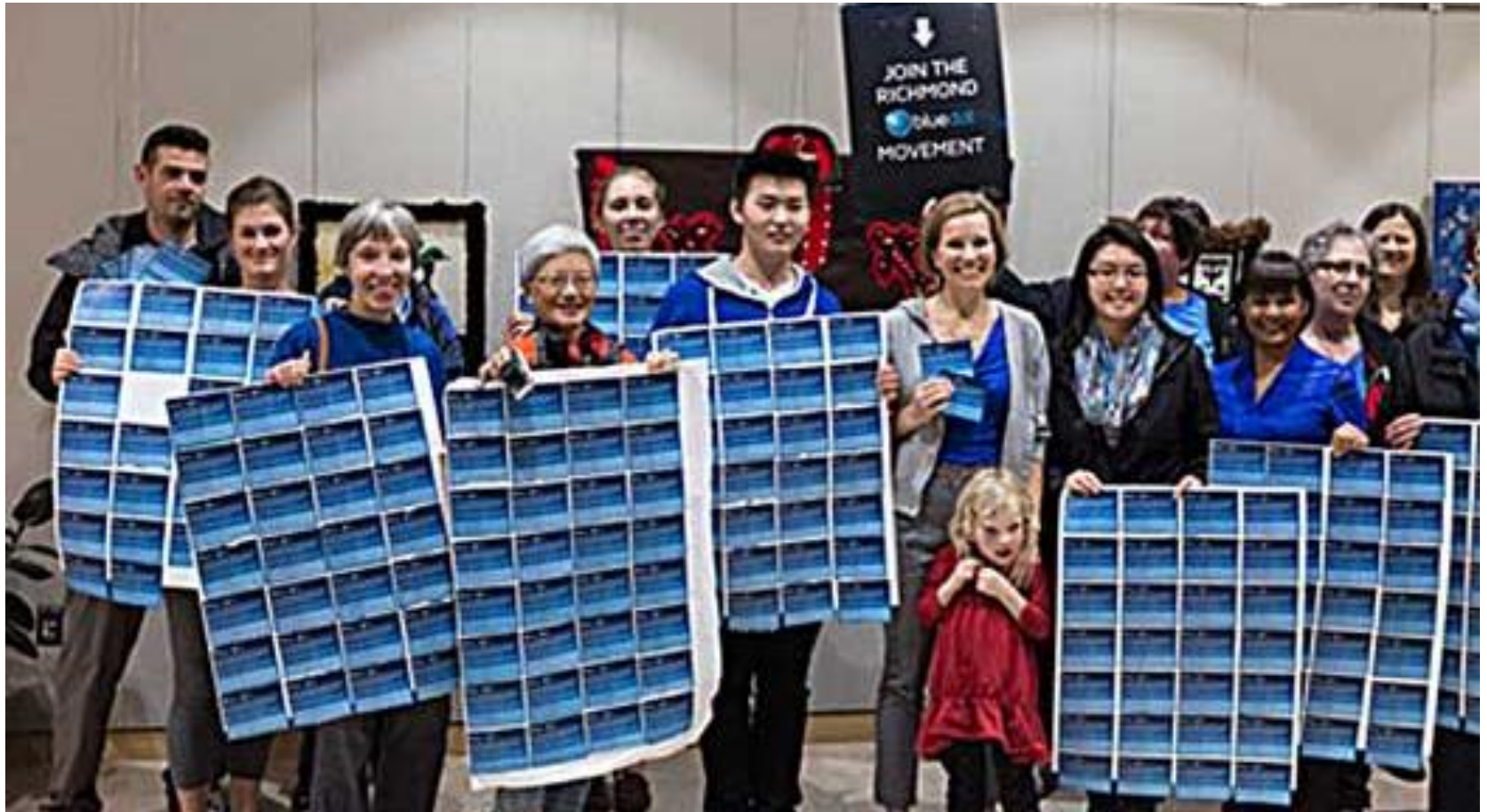
Blue Dot Volunteers in Richmond, BC