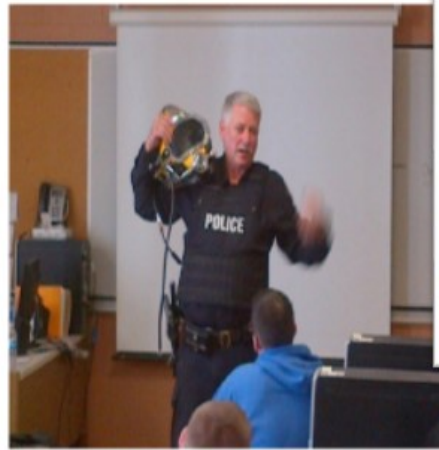
High Schools Co-op Program