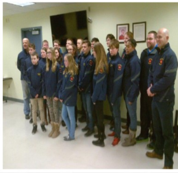
Stetsons & Spurs Group