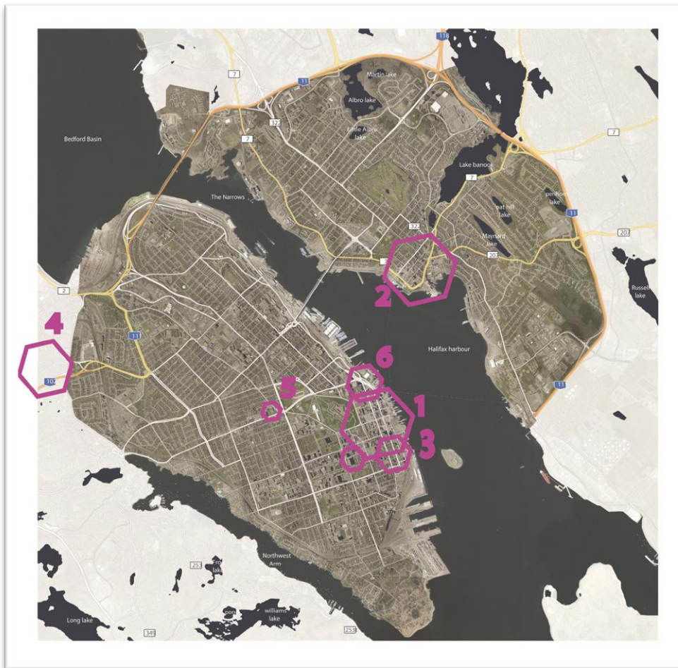
Figure 2 - Centre Plan Related Policy Projects

In addition, privately led Master Planning has proceeded at Shannon Park. Figure 2 shows the geographic location of these projects.