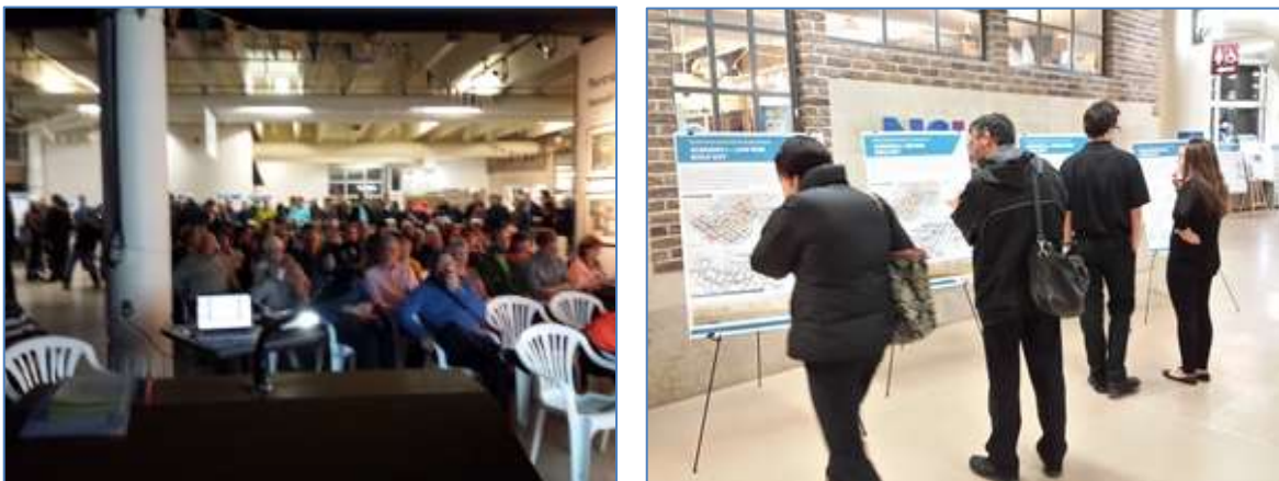
Fig.1. Participants at the Dec. 1, 2014 Public Presentation & Open House, Alderney Market

The view plane work was completed in 2013, leading to community engagement on potential changes to building height and form in the Business and Waterfront Districts in January 2014 and in December 2014. This document provides a summary of the process and public input received as part of the Downtown Dartmouth Plan Update.