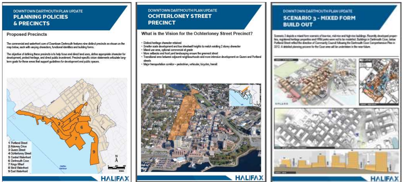
Fig. 4 Example of Dec. 1, 2014 Open House posters

Approximately 200 residents and interested stakeholders attended the Dec. 1, 2014 Presentation & Open House.