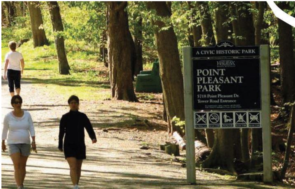
Figure 1 Typical Park Signage