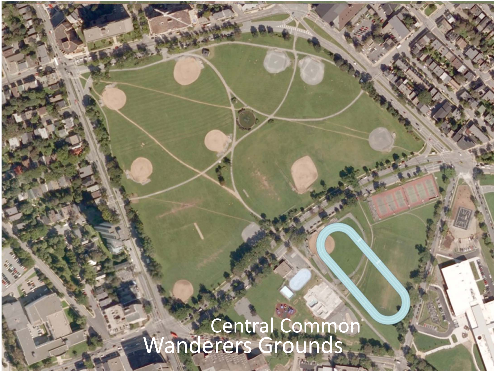
Central Common Wanderers Grounds