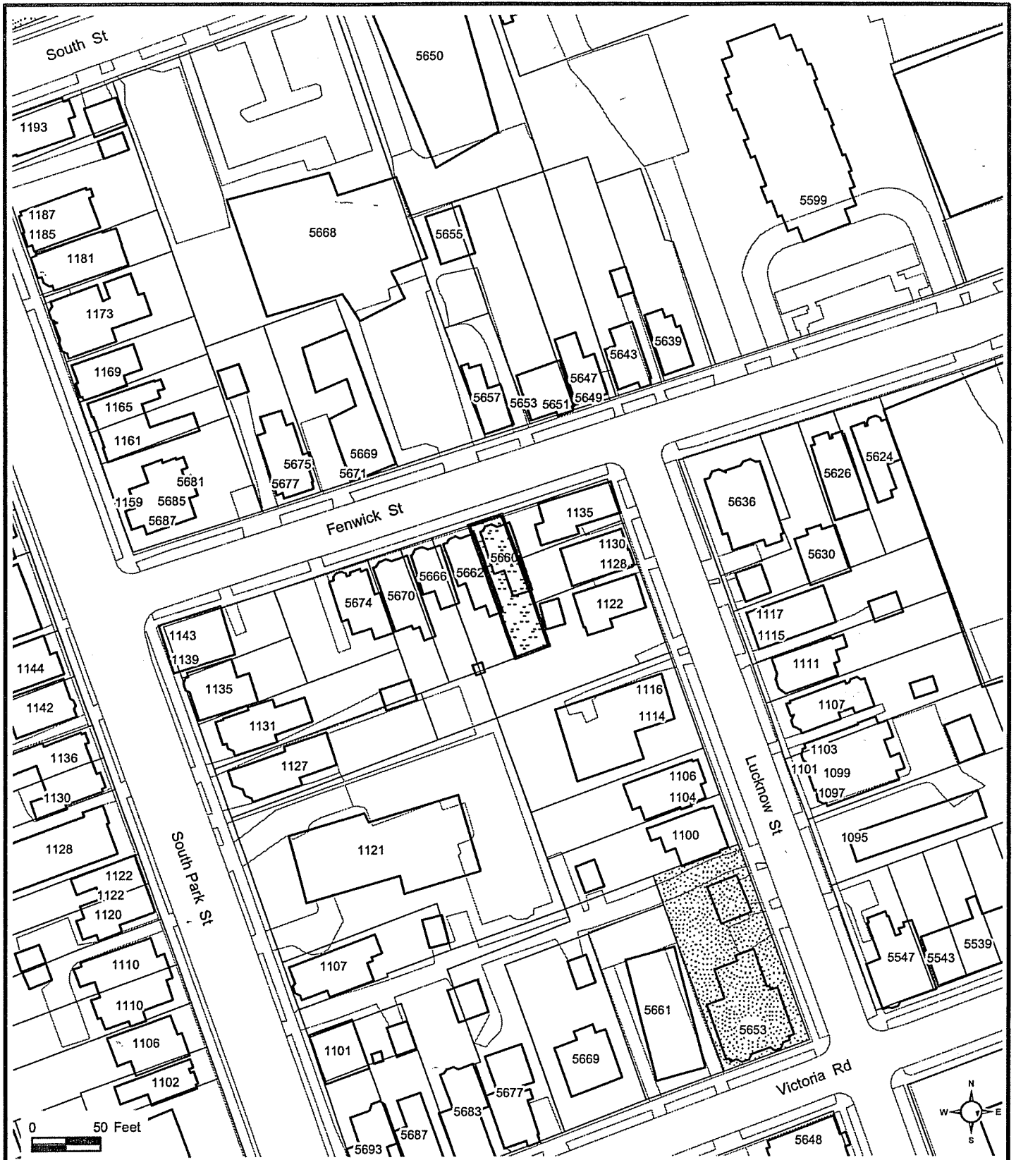
Map 1 - Location Map