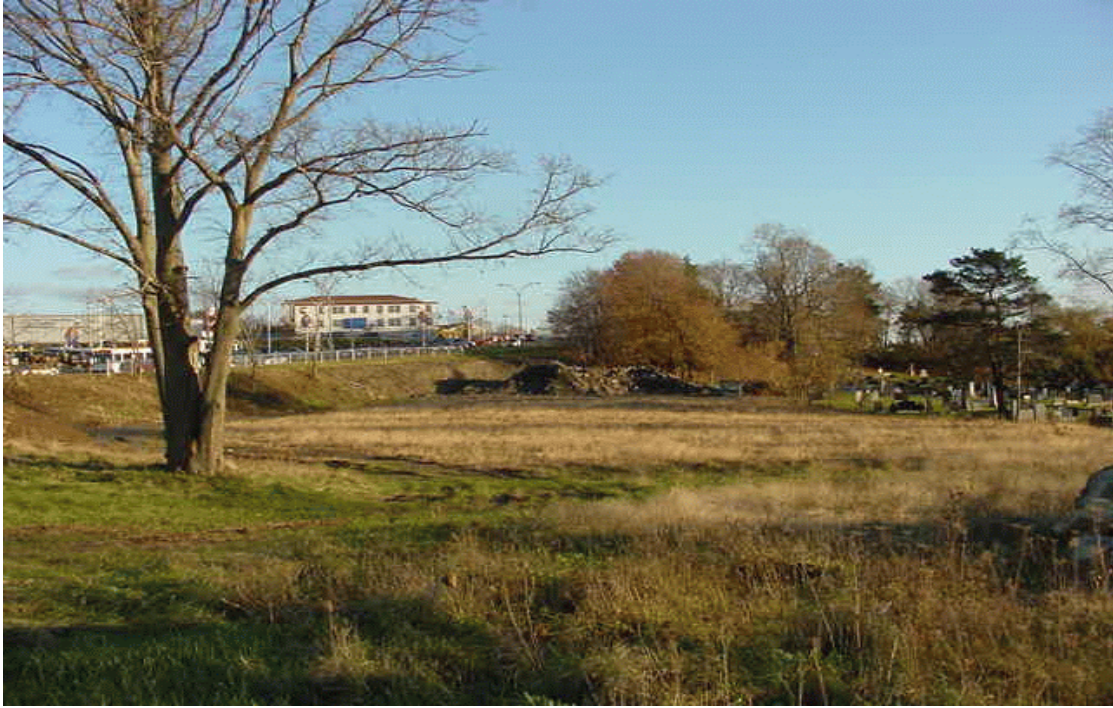
View of Old Windsor Street right of way as seen from Kempt Road