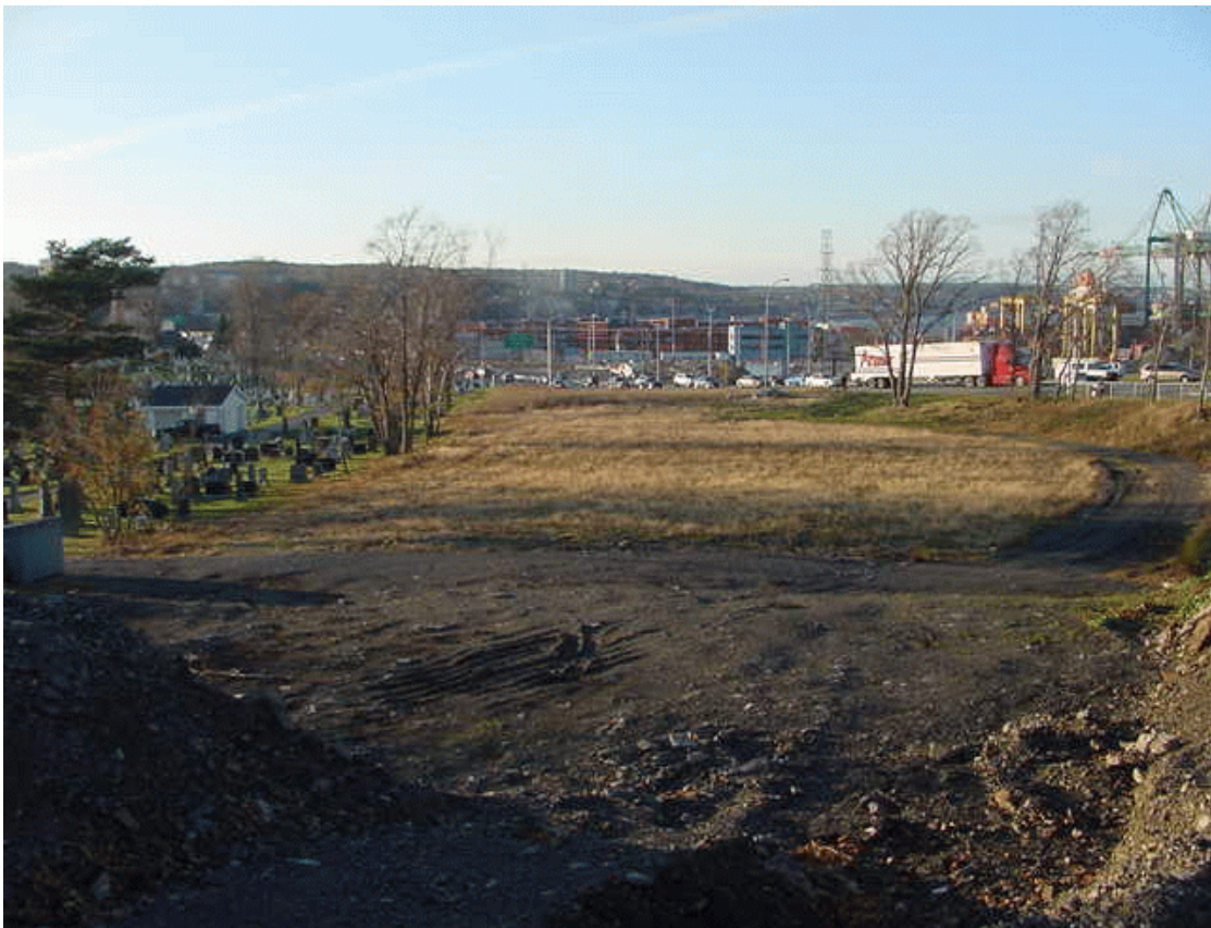
View of Old