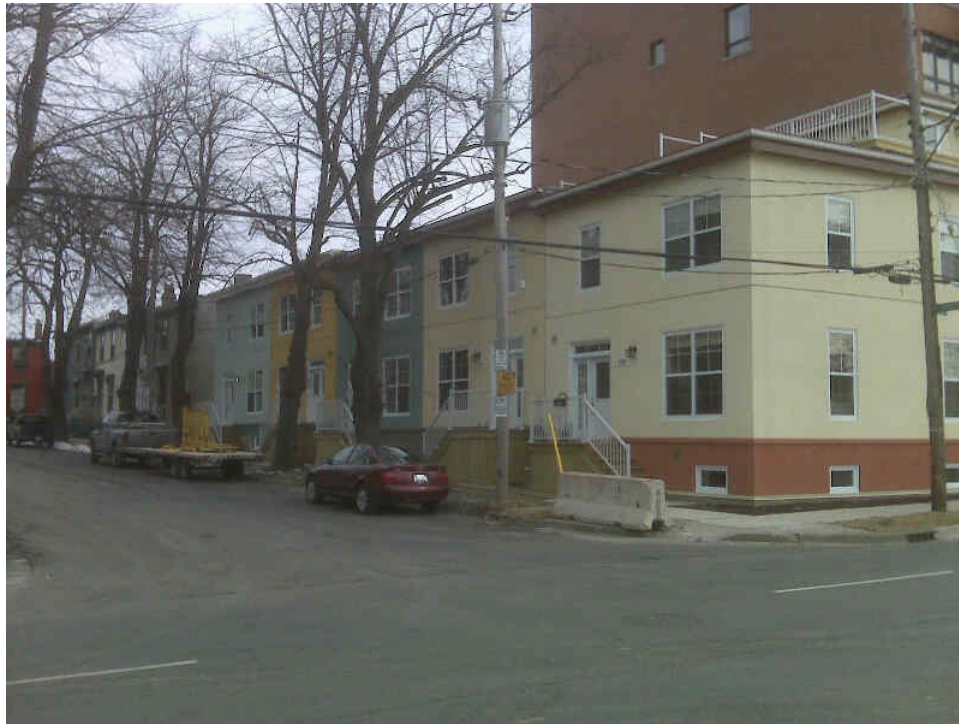
View of corner of Cunard Street & Prince Place