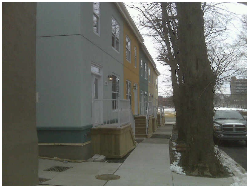
View of area of