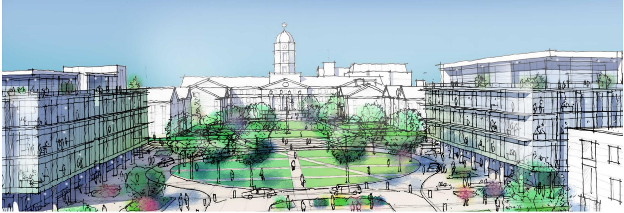
Attachment C - Dalhousie Quad Project Concept