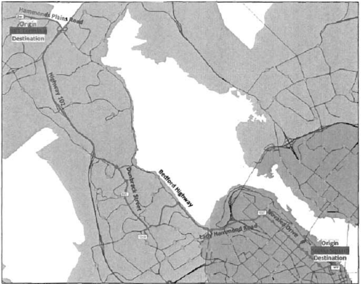
Figure 14: Major Transit Route - Alternative A