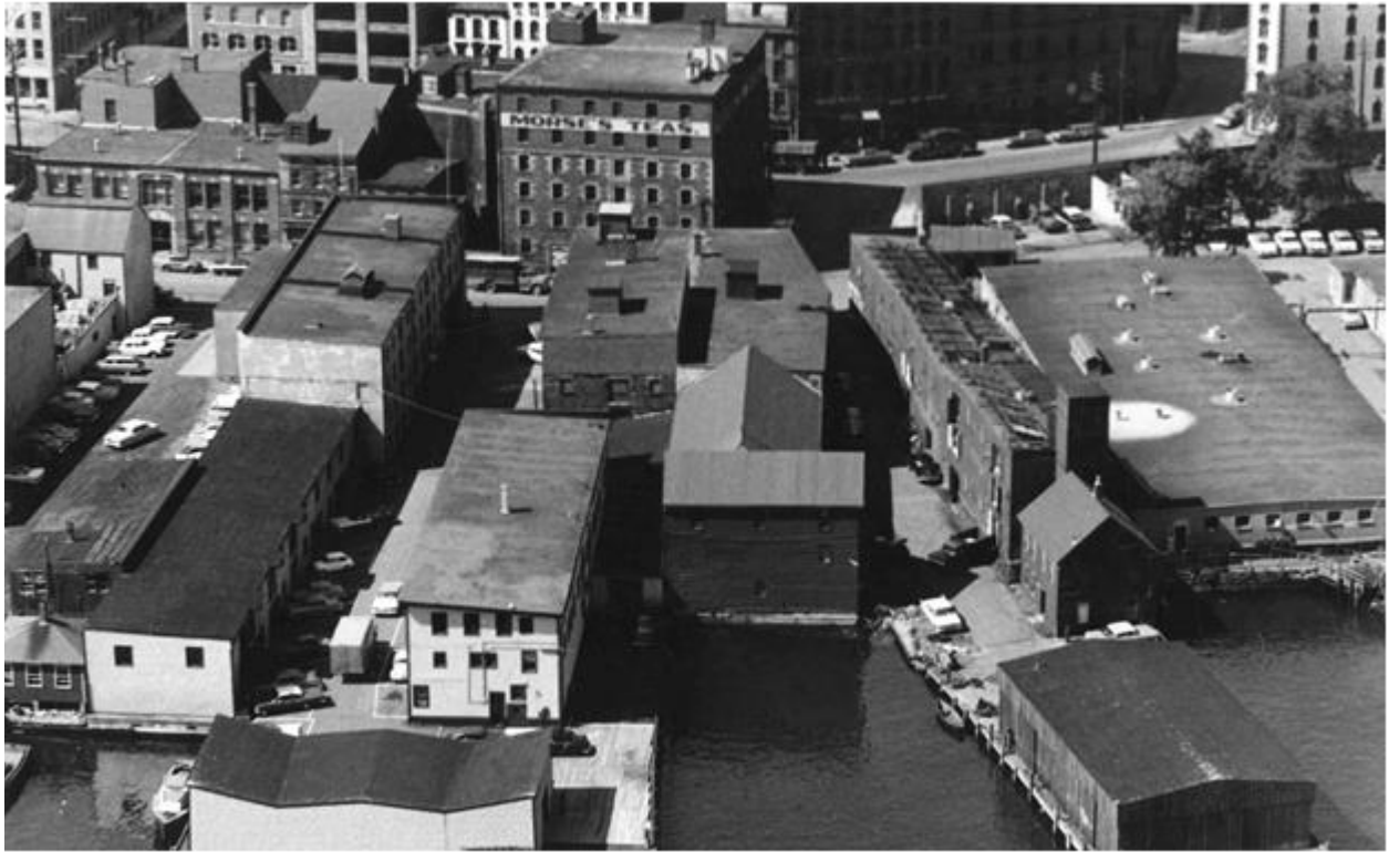
Attachment D: Photograph of 1877 Hollis Street (c.1960)