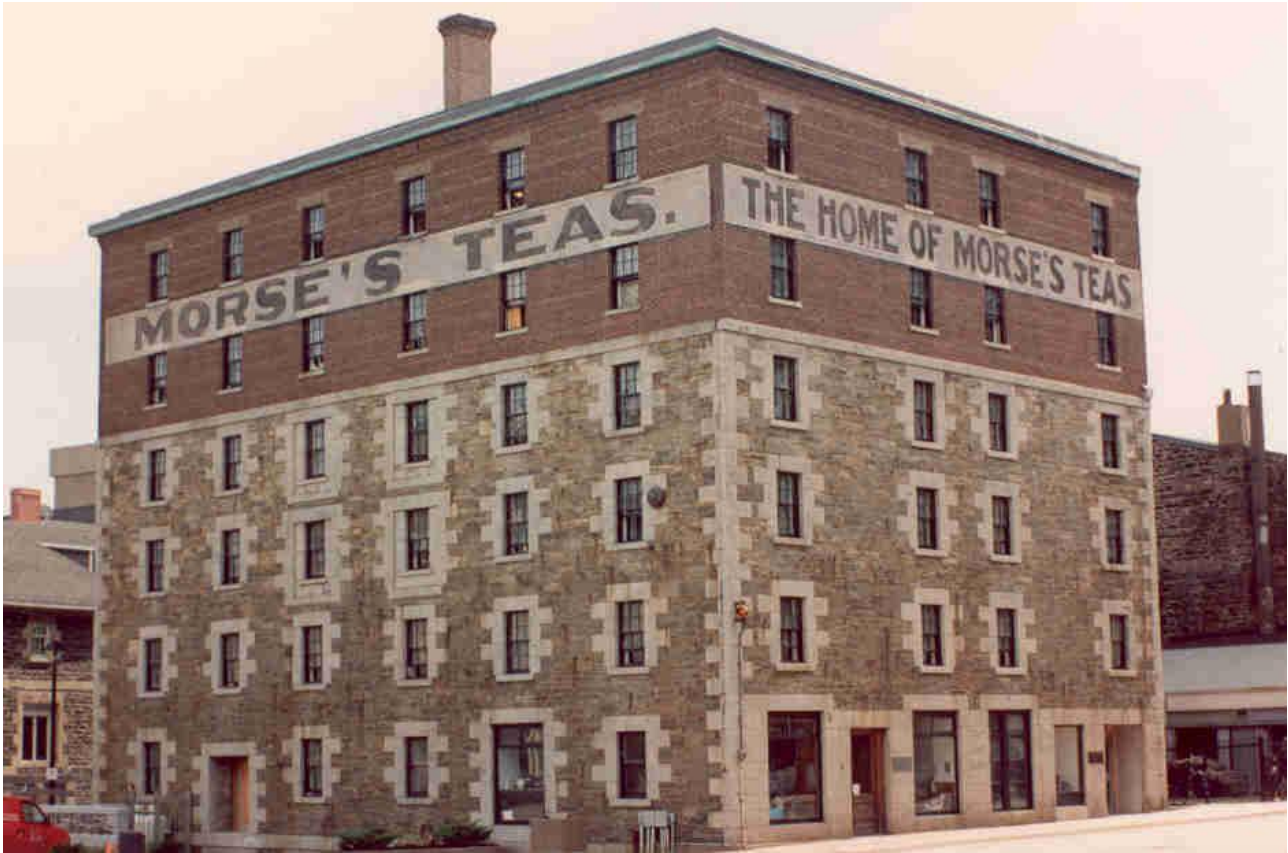
Attachment B: Photograph of 1877 Hollis Street (c.1980)