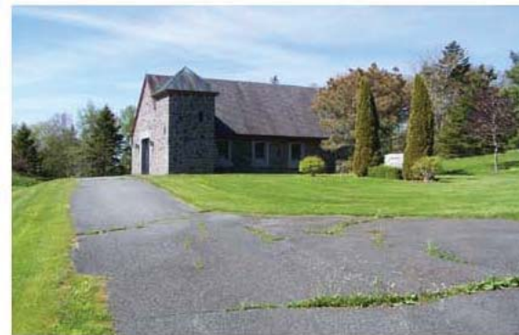
2014 Photo of Santa Maria del Pilar Chapel