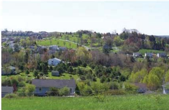
2014 View of Middle Sackville from Oland's Hill