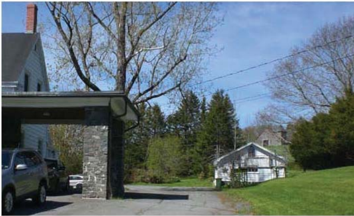
2014 Photo of Chapel in relation to Lindwood House