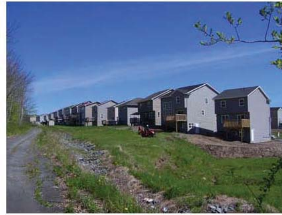
2014 Photo of decommissioned road and new development