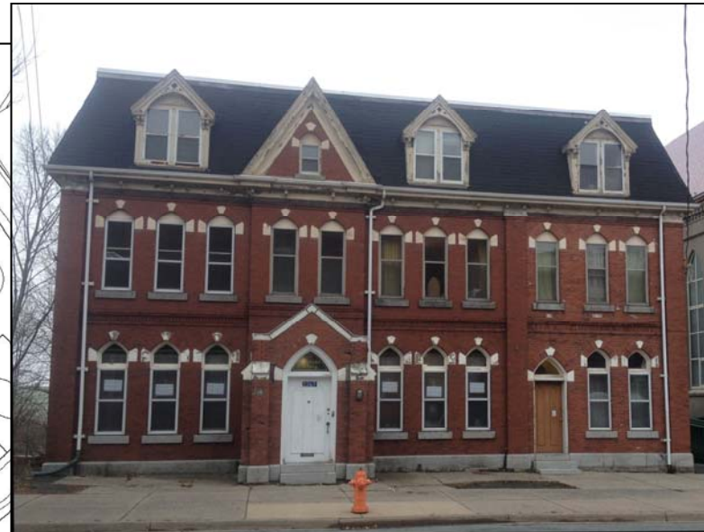
2267 Brunswick Street, Halifax (St. Patrick's Rectory)