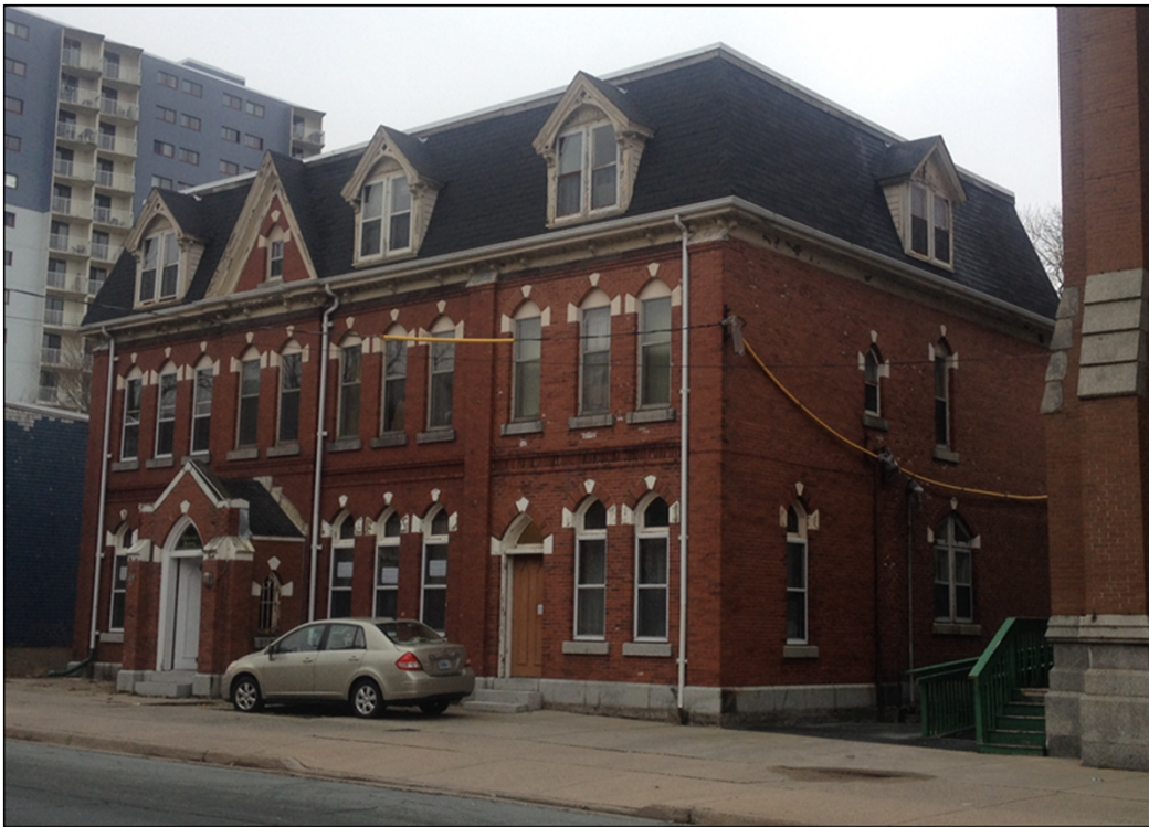
Deregistration of 2267 Brunswick Street, Halifax