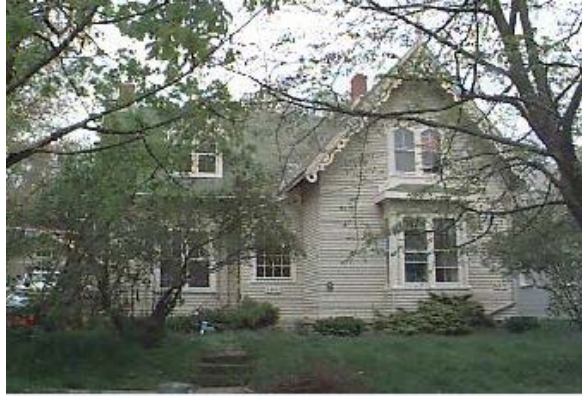
Application Number 16-009

Address: 6881 Churchill Drive Name: Blink Bonnie Building Age: c. 1865 Proposed Work: roof shingling replacement Score: 12/14 Estimate: $15,800 Recommended grant award of: $7,900