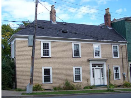
Application Number 16-018

Address: 1597 Dresden Row Name: Bollard House Age: c. 1835 Proposed Work: window replacement Score: 7/14 Estimate: $27,325 Recommended placement No. 1 on Stand-by list (grant amount of $10,000)