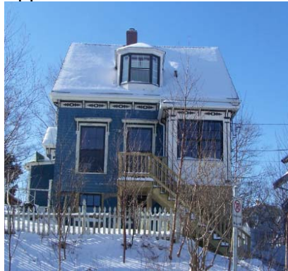
Application Number 16-011

Address: 15 Pine Street Name: George Meisner Building Age: c. 1864 Proposed Work: dormer replacement Score: 7.5/14 Estimate: $7,960 Recommended placement No. 1 on Stand-by list: (grant amount of $3,980)