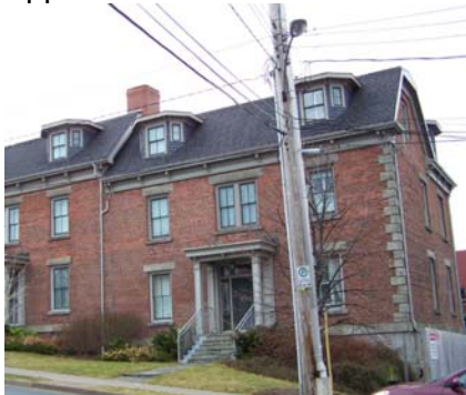
Application Number 16-017

Address: 5419 Portland Place Name: Walden Square Age: c. 1864 Proposed Work: repair and replacement of three dormers Score: 9/14 Estimate: $8,000 Recommended grant award of: $4,000