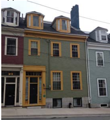
Application Number 16-026

Address: 5145 Morris Street Name: E.B. Strickland House Age: c. 1869 Proposed Work: replacement of windows, rear decking Score: 8/14 Estimate: $36,000 Recommended grant award of: $10,000