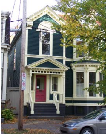
Application Number 16-023

Address: 5675 Inglis Street Name: Mitchell House Age: c. 1894 Proposed Work: window replacement, general repairs Score: 6.5/14 Estimate: $18,435 Recommended placement No. 5 on Stand-by list (grant amount of $9,217)