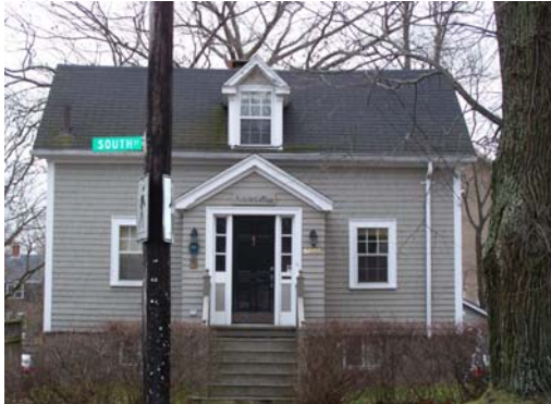
Application Number 16-014

Address: 6080 South Street Name: Acacia Cottage Age: c. 1816 Proposed Work: partial roof replacement, front porch repair Score: 10/14 Estimate: $3,310 Recommended grant award of: $1,655