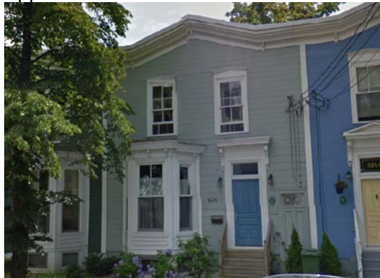
Application Number 16-034

Address: 5244 Smith Street Name: Victorian Era Streetscape Age: c. 1880 Proposed Work: paint cladding and trim at front and rear, front step replacement Score: 8.5/14 Estimate: $9,270 Recommended grant award of: $4,635