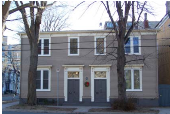
Application Number 16-020

Address: 1073 Tower Road Name: Victorian Era Streetscape Age: c. 1890 Proposed Work: replacement of front door and surround Score: 8/14 Estimate: $14,500 Recommended grant award of: $7,250