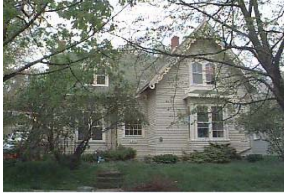
Application Number 16-009

Address: 6881 Churchill Drive Name: Blink Bonnie Building Age: c. 1865 Proposed Work: roof shingling replacement Score: 12/14 Estimate: $15,800 Recommended grant award of: $7,900