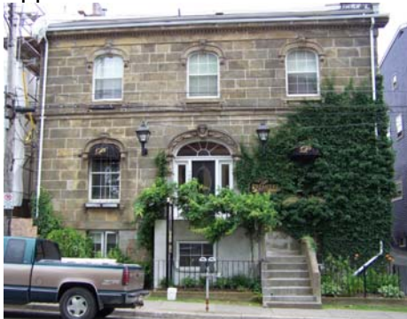
Application Number 16-016

Address: 1266 Queen Street Name: Mary Queen of Scots Building Age: c. 1861 Proposed Work: masonry repair and repointing Score: 8/14 Estimate: $24,700 Recommended grant award of: $10,000