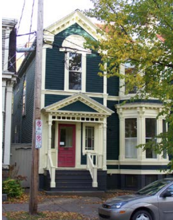
Application Number 16-023

Address: 5675 Inglis Street Name: Mitchell House Age: c. 1894 Proposed Work: window replacement, general repairs Score: 6.5/14 Estimate: $18,435 Recommended placement No. 4 on Stand-by list (grant amount of $9,217)