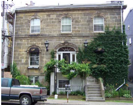
Application Number 16-016

Address: 1266 Queen Street Name: Mary Queen of Scots Building Age: c. 1861 Proposed Work: masonry repair and repointing Score: 8/14 Estimate: $24,700 Recommended grant award of: $10,000