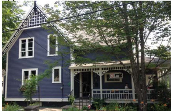
Application Number 16-012

Address: 29 First Avenue Name: Knight House Age: c. 1902 Proposed Work: reconstruction of two chimneys Score: 9/14 Estimate: $6,770 Recommended grant award of: $3,385