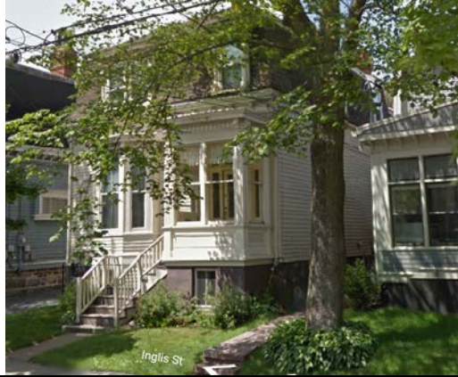
Application Number 16-028

Address: 5657 Inglis Street Name: Sheehan House Age: c. 1883 Proposed Work: roof and window replacement Score: 8.5/14 Estimate: $39,130 Recommended grant award of: $10,000