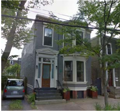
Application Number 16-024

Address: 5660 Fenwick Street Name: Cahill House Age: c. 1895 Proposed Work: window replacement and cladding repair Score: 6.5/14 Estimate: $22,555 Recommended placement No. 4 on Stand-by list (grant amount of $10,000)