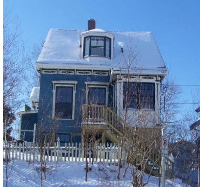
Application Number 16-011

Address: 15 Pine Street Name: George Meisner Building Age: c. 1864 Proposed Work: dormer replacement Score: 7.5/14 Estimate: $7,960 Recommended grant award of: $3,980