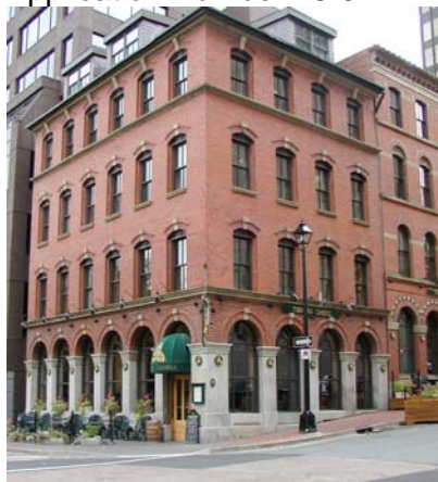
Application Number 16-022

Address: 5136 Prince Street Name: Geldert Building Age: c. 1862 Proposed Work: replacement of front and side entrance and doors Score: 8/14 Estimate: $8,500 Recommended grant award of: $4,250