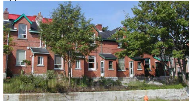
Application Number 16-006

Address: 2062 Brunswick Street Name: Churchfield Barracks Age: c. 1901 Proposed Work: replace 3 windows, front door replacement, roof repair Score: 10.5/14 Estimate: $9,697 Recommended grant award of: $4,849