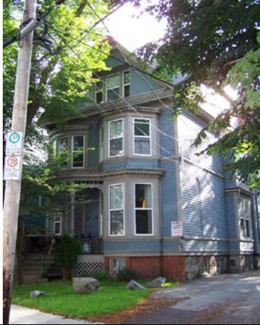
Application Number 16-013

Address: 1041 Tower Road Name: Victorian Era Streetscape Age: c. 1875 Proposed Work: wood cladding replacement, roof shingle replacement Score: 9/14 Estimate: $39,287 Recommended grant award of: $10,000