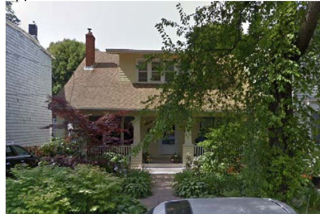
Application Number 16-008

Address: 6201 Shirley Street Name: James Rose House Age: c. 1920 Proposed Work: exterior façade repair, window replacement Score: 8.5/14 Estimate: $17,474 Recommended grant award of: $8,737