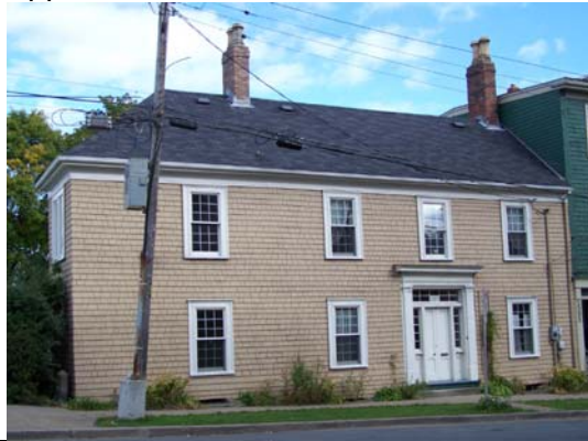
Application Number 16-018

Address: 1597 Dresden Row Name: Bollard House Age: c. 1835 Proposed Work: window replacement Score: 7/14 Estimate: $27,325 Recommended placement No. 2 on Stand-by list (grant amount of $10,000)