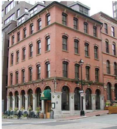
Application Number 16-022

Address: 5136 Prince Street Name: Geldert Building Age: c. 1862 Proposed Work: replacement of front and side entrance and doors Score: 8/14 Estimate: $8,500 Recommended grant award of: $4,250