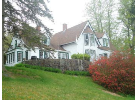
Application Number 16-029

Address: 85 Boscobel Road Name: Boscobel House Age: c. 1860 Proposed Work: roof repair/replacement Score: 10.5/14 Estimate: $12,900 Recommended grant award of: $6,450