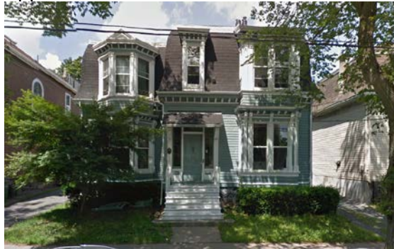
Application Number 16-010

Address: 5663 Inglis Street Name: Fraser House Age: c. 1894 Proposed Work: removal of rear addition, façade repair, step/stair replacement, roofing Score: 8/14 Estimate: $17,839 Recommended grant award of: $8,919