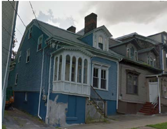
Application Number 16-032

Address: 5266 South Street Name: G. E. Ahern House Age: c. 1870 Proposed Work: cladding repair Score: 8/14 Estimate: $4,800 Recommended grant award of: $2,400