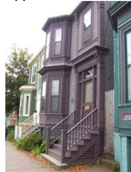
Application Number 16-007

Address: 2548 Gottingen Street Name: Leo Fultz House Age: c. 1894 Proposed Work: chimney repointing, exterior façade repair Score: 10/14 Estimate: $8,360 Recommended grant award of: $4,180