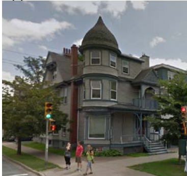
Application Number 16-025

Address: 1293 South Park Street Name: Victorian Era Streetscape Age: c. 1897 Proposed Work: repair and replacement of cladding, trim, wooden detailing Score: 7.5/14 Estimate: $17,000 Recommended grant award of: $8,500